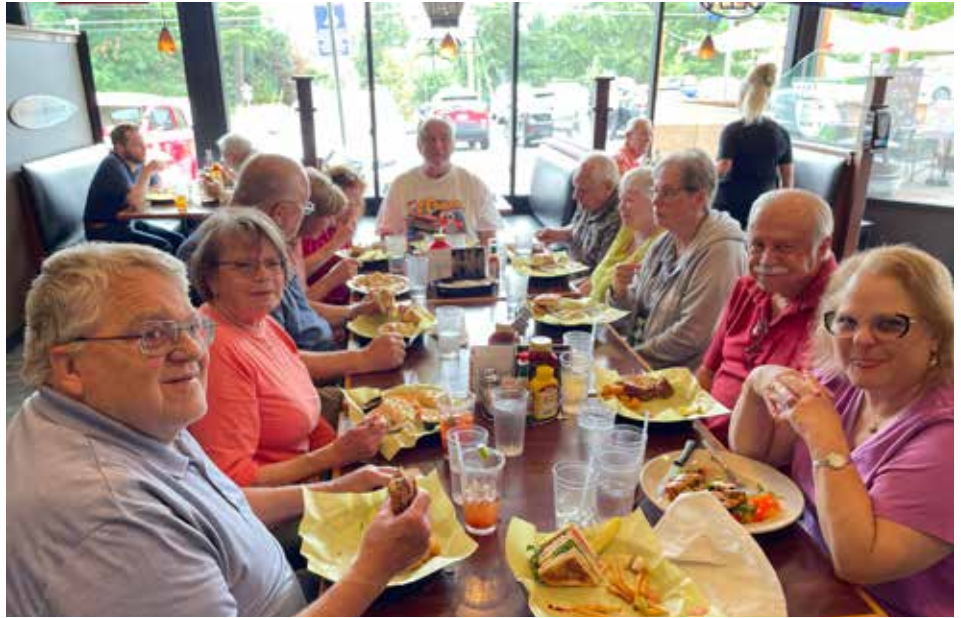
Mayflower tours usually involve lunch someplace pleasant, and this time it was the Linn City Pub in West Linn, where CPPC members regained their strength after trekking around extensive gardens at Luscher Farm. Next up, sometime in August, Mayflowers will be touring the Pearson Air Museum and Officers Row at Fort Vancouver, WA.

Next month we plan on going to Vancouver WA to visit the Pearson Air Museum and Officers Row in the Fort Vancouver area. More information about that will be available in the coming weeks.